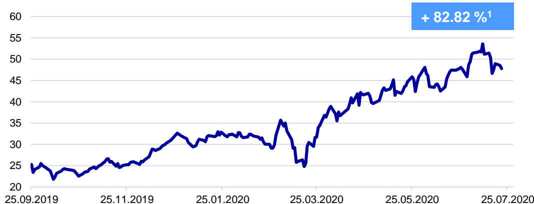
TeamViewer (Xetra) in EUR