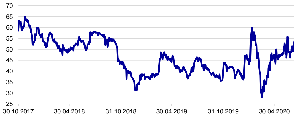
Mynaric (Xetra) in EUR